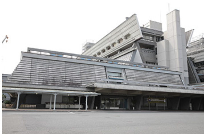
The 2013 IGU Regional Conference venue: Kyoto International Conference Centre

The first regional conference of three in the period between the Congresses in Cologne (2012) and Beijing (2016) was held in Kyoto on 3-9 August 2013. The conference gathered 1431 participants from 61 countries/regions, including 289 students. Such attendance is rather high for such meetings and nearly equal that at the IGU Congress in Tokyo (1980) and considerably more than expected by the Organizing Committee. An important proportion of participants came from the Asian-Pacific region which justifies the very idea of regional conferences since one of the most important objectives is to contribute to networking geographers in a particular region of the world. Naturally, the largest number of participants was from Japan (688) followed by Taiwan (78), the US (70), India (55) and China (53). The Science Council of Japan provided financial support to cover all of the room charges at the Kyoto International Conference Center, allowing us to set a very reasonable registration fee despite the elegant facilities.