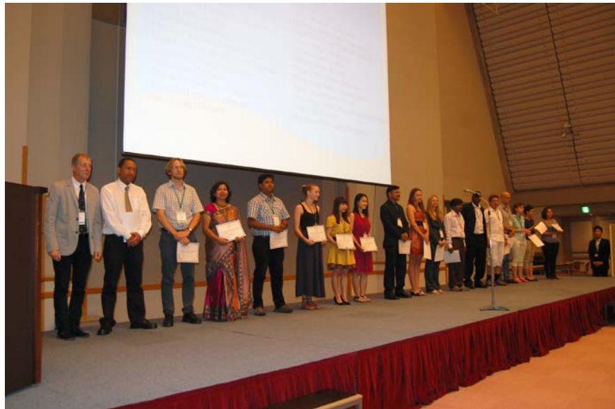
Award ceremony for the IGU Travel Grant awardees

The Conference contributed to the development of cooperation between IGU Commissions. The total number of presentations made at the conference was 1,256: nine at plenary sessions, 780 at commission sessions, 382 (254 oral and 128 poster) at general sessions, 76 at joint sessions, and nine more at other sessions. Two sessions may deserve a special mention. The first one is the special session on the status of geographical journals, the issues of their ranking and open access. It was shown that the abuse of citation indices can do particular harm to geography because of discrimination of regional studies, human geography and publications in the languages other than English. It represents a serious threat to the future of geographical departments and can undermine the personal career of many scholars. It was decided that IGU should formally endorse the San Francisco Declaration and develop recommendations to national research and education governmental institutions. The second one was the session organized on the initiative of IGU Executive and devoted to the experience of geography teaching in universities.