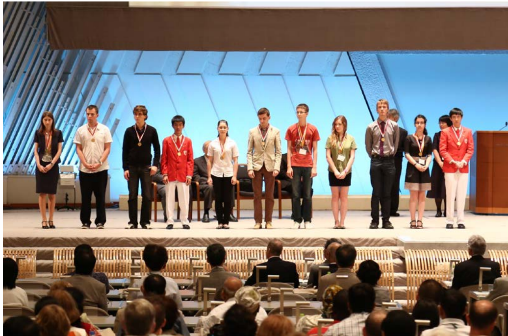
Medal winners of the Geographical Olympiad (iGeo) competition at the Opening Ceremony

The conference's motto was "Traditional Wisdom and Modern Knowledge for the Earth's Future" which corresponded well to its main objective - examination of the relationship between society/culture and environment and the venue, the ancient capital of Japan. The opening ceremony was graced by the attendance of Their Imperial Highnesses Prince and Princess Akishino and several other distinguished guests.