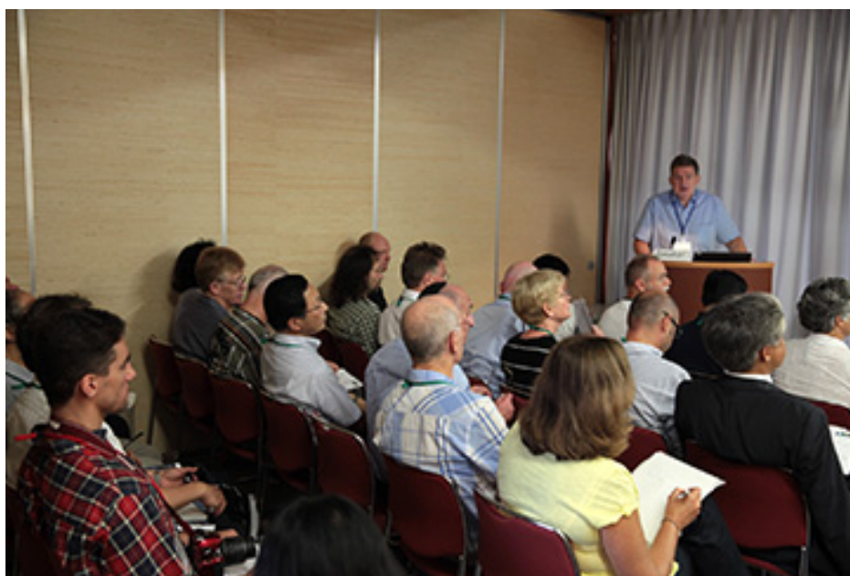
IGU President Kolossov's greeting to the chairs of IGU Commissions and National Committees

The Conference contributed to the development of cooperation between IGU Commissions. The total number of presentations made at the conference was 1,256: nine at plenary sessions, 780 at commission sessions, 382 (254 oral and 128 poster) at general sessions, 76 at joint sessions, and nine more at other sessions. Two sessions may deserve a special mention. The first one is the special session on the status of geographical journals, the issues of their ranking and open access. It was shown that the abuse of citation indices can do particular harm to geography because of discrimination of regional studies, human geography and publications in the languages other than English. It represents a serious threat to the future of geographical departments and can undermine the personal career of many scholars. It was decided that IGU should formally endorse the San Francisco Declaration and develop recommendations to national research and education governmental institutions. The second one was the session organized on the initiative of IGU Executive and devoted to the experience of geography teaching in universities.