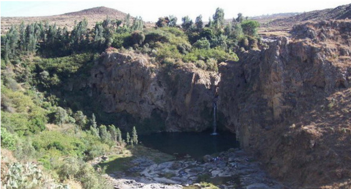
The Romanat travertine Dam

4.2) EURAC, Bolzano (Italy), 13-14 March 2008