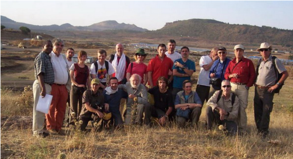
Participants to the field trip in the northern Ethiopian highlands, from February 27 to 28