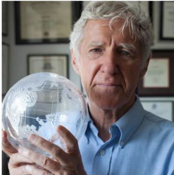
Lester Brown, President of the Earth Policy Institute and recipient of the IGU's highest award: The IGU Planet and Humanity Medal