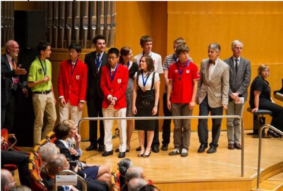
Olympiad winners receive their medals at the opening ceremony of the Cologne Congress.

Particular attention was paid to geographical education and young scholars. School teachers came to the Congress for a full day of sessions and lectures. The programme “School at the IGC and the IGC at school” was supported by the federal and regional ministries of education and sponsored a series of lectures of well-known geographers at high schools of North Rhine–Westphalia. As usually, the Congress hosted the World Geographical Olympiad which reunited 128 high school’s pupils from 32 countries. Its agenda consisted of written and multimedia tests and a field tour. Besides that, the participants of the Olympiad had to prepare a presentation on water resources and problems of water use. The winners were honoured by high officials at the opening ceremony of the Congress.