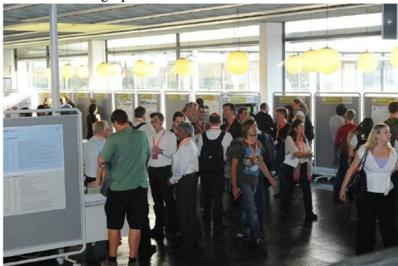
Congress delegates at one of the poster sessions

A pre-Congress conference discussed the development of geography in Europe. A number of special sessions concerned the needs of practitioners, and others devoted to the main IGU projects and initiatives such as the International Year of Global Understanding, Sustainable Cities and the World Data Base on Geographical Journals.