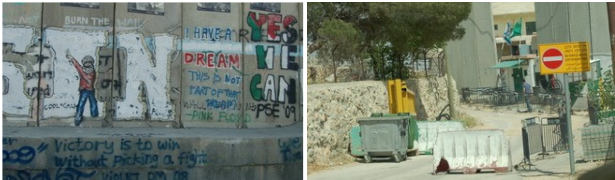
Left: murales on the east side of the wall – Right: a check point on the east-west border

They showed us around campus, seeing students (females as many as males, if not more), leading us in a visit to the Abu Jihad Museum for Prisoners Movement Affairs and hosted us to a delicious lunch.