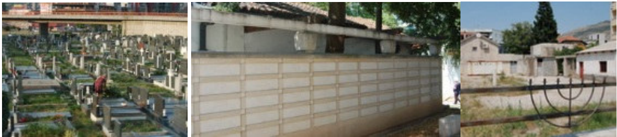
Left, in Sarajevo a catholic cemetery under a highway and the memorial for recently killed Muslim; Right, in Mostar a space has been reserved to build a synagogue, but today not a single Jewish lives or want to come back here

In my comments during the journey I focused mainly on history and my own life's experiences from the early one-day shopping tours to Trieste, everyday life under the one-party communist rule, transition to democracy and turbulent times after which the former federal republics gained independence. I also tried to point out differences between Slovenia, Croatia and Bosnia-Herzegovina, which may not be visible to a foreigner. While visiting different sites or driving along them I pointed out their specific symbolic significance for insiders.