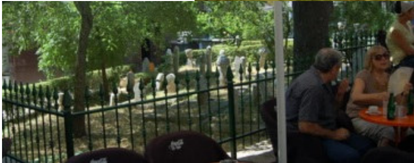
And today cemetery are common feature on slopes near a polje, as well as in town centers

In my comments during the journey I focused mainly on history and my own life's experiences from the early one-day shopping tours to Trieste, everyday life under the one-party communist rule, transition to democracy and turbulent times after which the former federal republics gained independence. I also tried to point out differences between Slovenia, Croatia and Bosnia-Herzegovina, which may not be visible to a foreigner. While visiting different sites or driving along them I pointed out their specific symbolic significance for insiders.