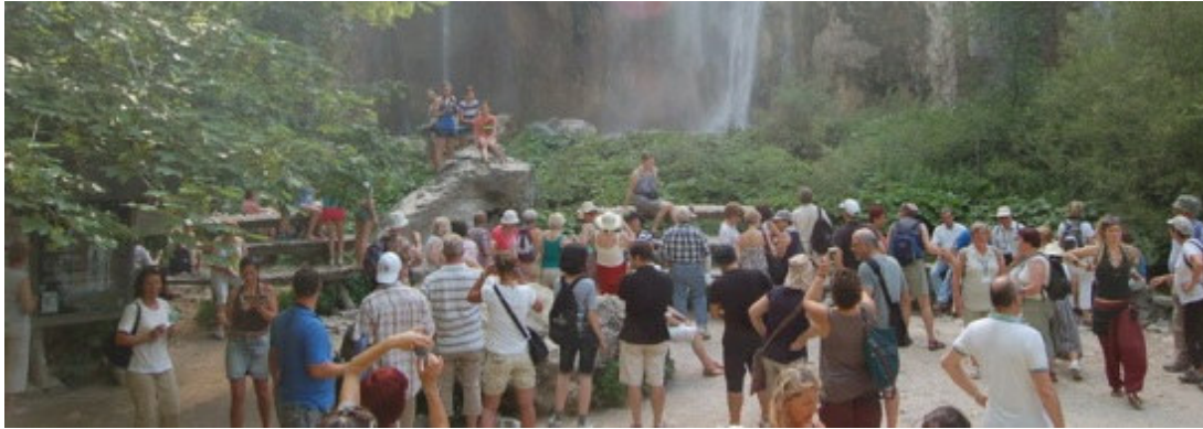
The peaceful atmosphere of the Plitvice Lakes National Park, renowned for waterfalls