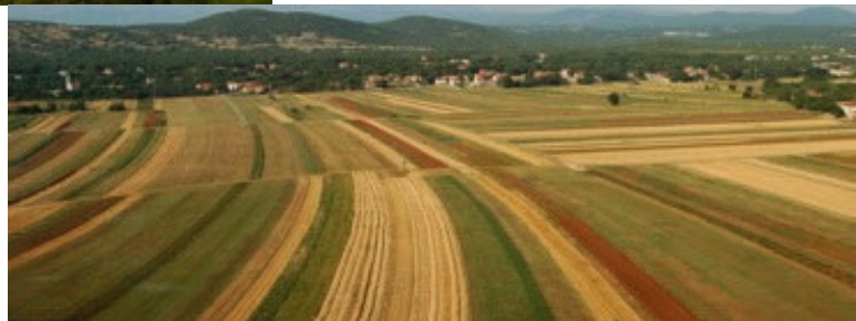
Poljen, surface feature of karst erosion, always wonderfully cultivated

In many ways it was also a journey through history of the part of Europe which only in the 20th century was several times politically integrated (by Austria-Hungary and Yugoslavia) as well as