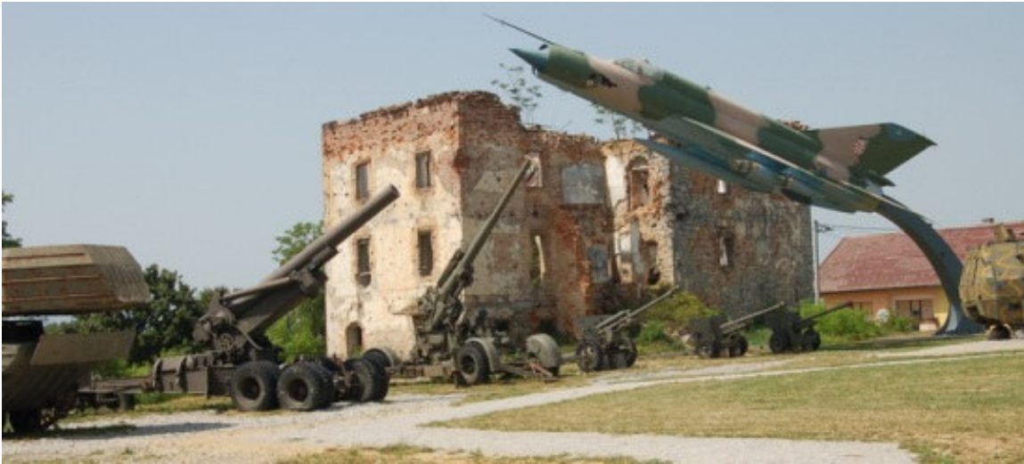
... not far from the impressive Open Air Museum in the severely damaged village of Turanj

The tour was organized as a part of the meeting of the border scholars who always like to cross borders. Consequently, I focused my guidance on different boundaries on the route, international and internal, geographical and historical, visible and non-visible, with control and without it. We started the tour crossing former Iron Curtain (Italy-Yugoslavia boundary) line, continued by crossing the new international boundaries between three ex-Yugoslavia successor states, and ended by crossing internal division line within Bosnia-Herzegovina (officially Inter-Entity Boundary Line) as well as the border between two country's formative geographical and historical regions, Bosnia and Herzegovina. We also drove through areas populated by different ethnic communities, usually clearly marked with respective national symbols (flags and grafites), cemeteries as well as newly built or renovated religious objects.