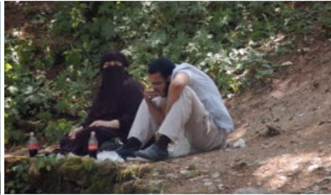
Optimistic end: new sources of energy are there and life will always continue, as here at the source of Bosna river