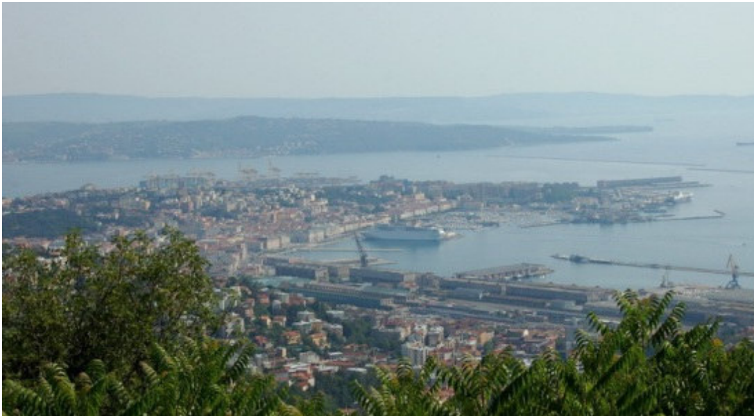
Trieste, seen from Opicina: view of the harbour, with some Slovenja and Croatia in the background

The participation to all these events has been completely successful. About one hundred geographers have taken part to the Conference, the majority of them from Italy (36 participants), immediately followed by USA (12), Poland (8), Spain (6), Finland (5), United Kingdom (4), and Hungary (3), but also from Russia, Israel, Thailand, Australia... for a total of 22 different countries. For the trip to Gorizia/Nova Gorica two full coaches have been necessary, and one for the five days in Slovenia, Croatia and Bosnia and Herzegovina. Finally, the cartographic exhibition, open until July 22 nd , has registered hundreds of visitors, and not only during the days of the Conference.