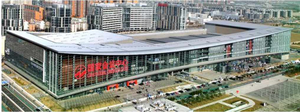
Congress venue (China National Convention Center)

The 33rd International Geographical Congress (IGC) will be held in Beijing, China from August 21st to 25th, 2016. The theme of the Congress is “Shaping Our Harmonious Worlds,” which highlights today’s common pursuit for harmony between humankind and nature, between environment and society, and for harmonious approaches to the world’s hazards and conflicts.