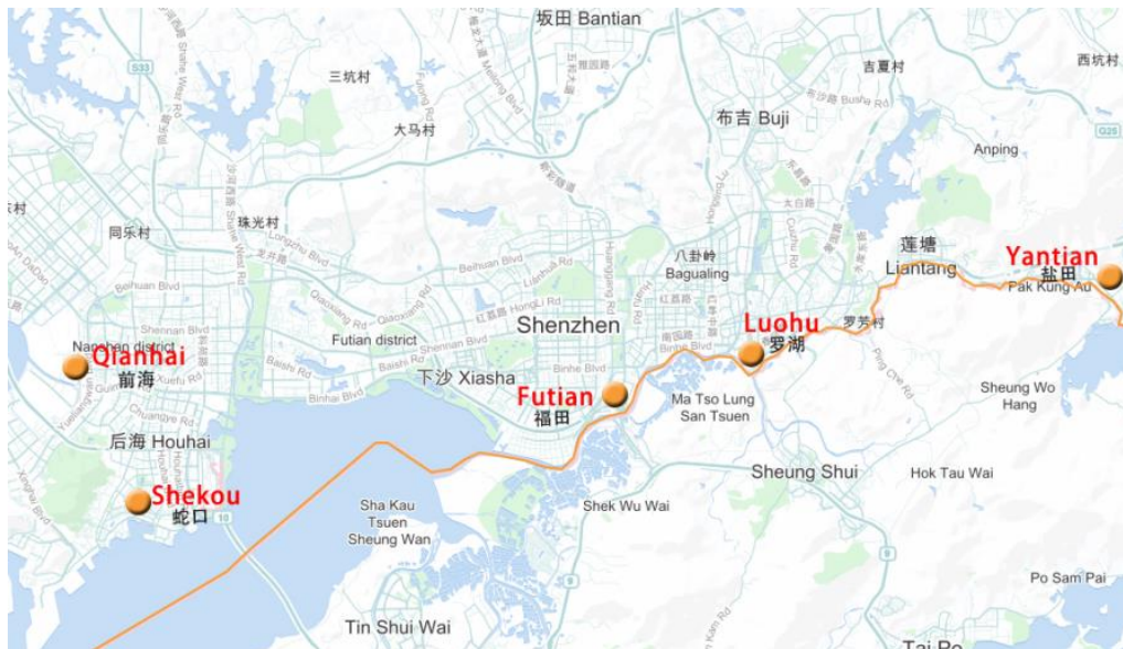
The route map of a one-day field trip to the Shenzhen/Hong Kong border region (by Yungang Liu)