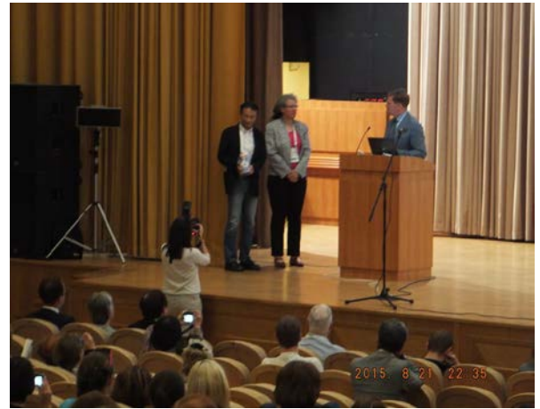
Award ceremony at Moscow State University, August 21, 2015

and researchers from low-income countries in its activities. The commission has a travel grant program for postgraduate students and early career scientists, giving preference to young scholars, in particular from developing countries. A young members' board stimulates the involvement of young scientists in the activities of the commission.