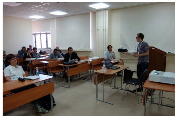
Session "For Kropotkin," August 20, 2015