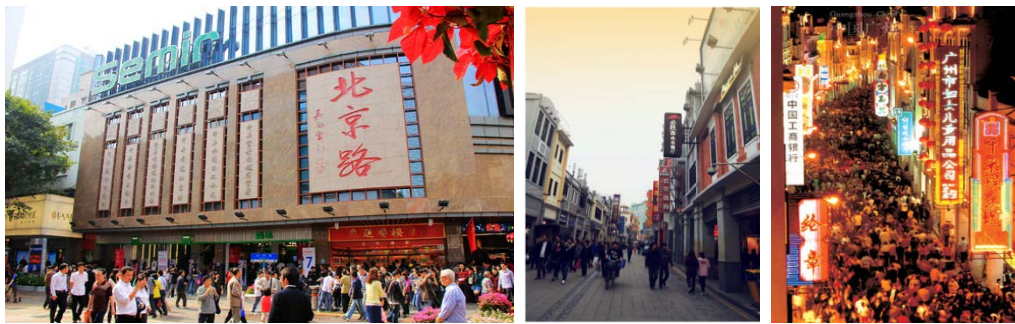
Urban landscapes in Guangzhou