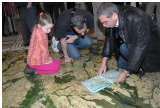
One of the best achievements of FIG is the invitation of some middle school teachers and pupils, giving them the opportunity to meet some of the best Geography scholars from all the world