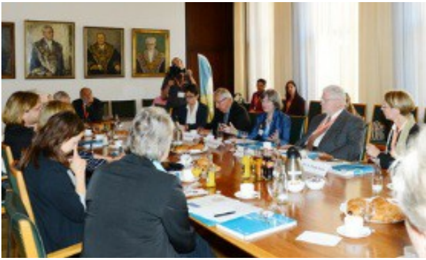
Left, Answering questions in the Press Conference.