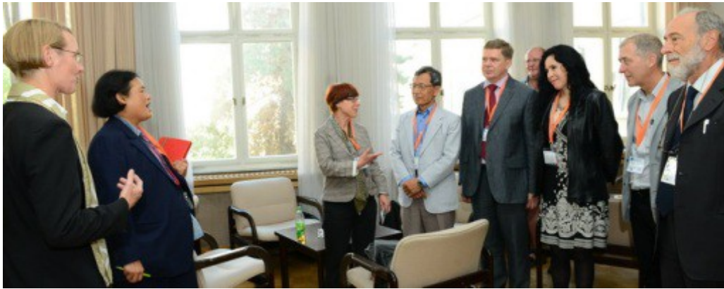
Her Royal Highness the Princess Maha Chakri Sirindhorn of Thailand visits the IGU EC

Expressed in absolute figures the IGC 2012 achieved a historic all-time high. With 2,865 registered visitors from 90 countries it was the largest IGU Congress so far. The attendance can be broken down as follows: 2,106 “full tickets” (1,350 persons paying the full conference fee, 438 doctoral candidates, 247 students, 71 accompanying persons), 403 day passes, 159 two-day passes, 197 participants in the symposium Geography and School. These figures far surpassed our original expectations. The plans, including the envisioned amount of space required, were based on an estimate of around 2000 participants.