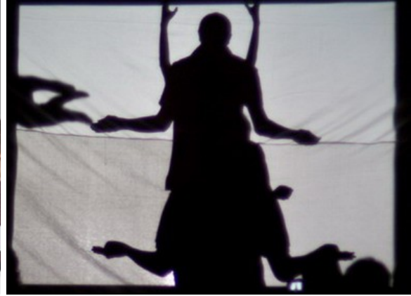
The young winner participants in iGeo (left) and (right) a moment of the rather impromptu organised intercultural show

In retrospect the modifications to the structure of the IGC, compared with earlier congresses, were a success. The four themes opened the congress for persons who had not previously participated in one of the IGU commissions, and the large number of suggestions for sessions and papers showed how much interest these themes generated. The four keynote sessions were very well attended and the eight speakers held inspiring talks. For an international conference the proportion of young participants was quite high. This we attribute to a further new program element, the Young Researchers' Forum, together with the relatively low congress fees. In eight earlier workshops young scientists were additionally given the opportunity to develop their skills, and the geography students' association held a poster competition and social events for young scientists. Active use of Facebook and Twitter also helped to strengthen existing networks and establish new ones. In our opinion the upgrading of the posters as a presentation form was a particular success. All poster sessions were scheduled without parallel sessions and, probably not least because of the prizes that were offered, posters developed into a genuine alternative to presenting a paper. A total of 180 posters were presented in two sessions and each time about 400 persons participated very actively.