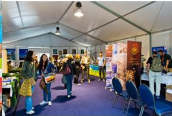
Left, check in at the main building; right: one of the exhibition tents

The atmosphere during the IGC 2012 made a particularly positive impression on the congress participants. This pleasant atmosphere was mainly thanks to the efforts of the student volunteers – soon referred to as “blue cloud” because of their blue T-shirts. 195 geography students assumed countless small and large responsibilities. They played an important role in bringing the IGC 2012 “marathon” to a spirited finish. Further aspects that made for pleasant discussions during the five days included the short waiting periods at registration (made possible because more than 1,500 registrations were completed by Sunday evening), the food and drink provided and additional services such as the daycare facility for children.