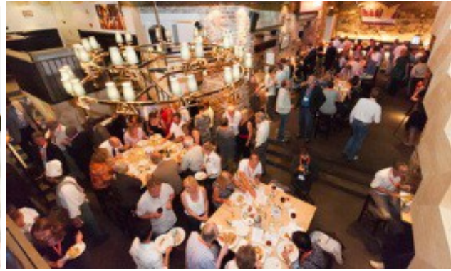
Right, the less unusual and most enjoyable Gala Dinner ever

Likewise, ever since 2004 we received a great deal of encouragement and valuable support from the Executive Committee of the IGU. The EC agreed to our experiment of adding the format of ‘Key topics’ to the IGC 2012 and looks back at the congress with just as much satisfaction as we do. We would like to thank the University of Cologne and the Deutsche Forschungsgemeinschaft (German Research Foundation) for their generous financial support; we are also grateful to the sponsors mentioned on our website.