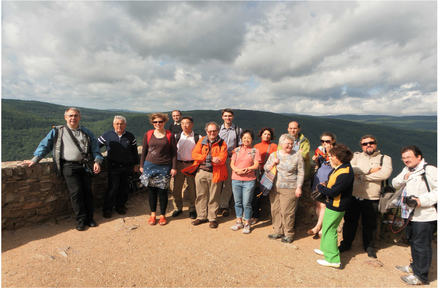
Photo 5. Pre-Congress fieldtrip to the Rhine Valley (August 2012). Group photo in the Niederwald Landscape Park.