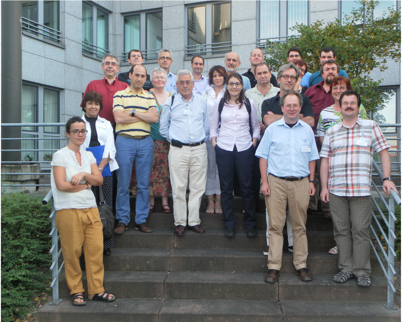
Photo 1. Leipzig (August 2012): Group photo of the majority of symposium participants, in front of the building which hosts the Leibniz – Institute für Länderkunde (IFL)