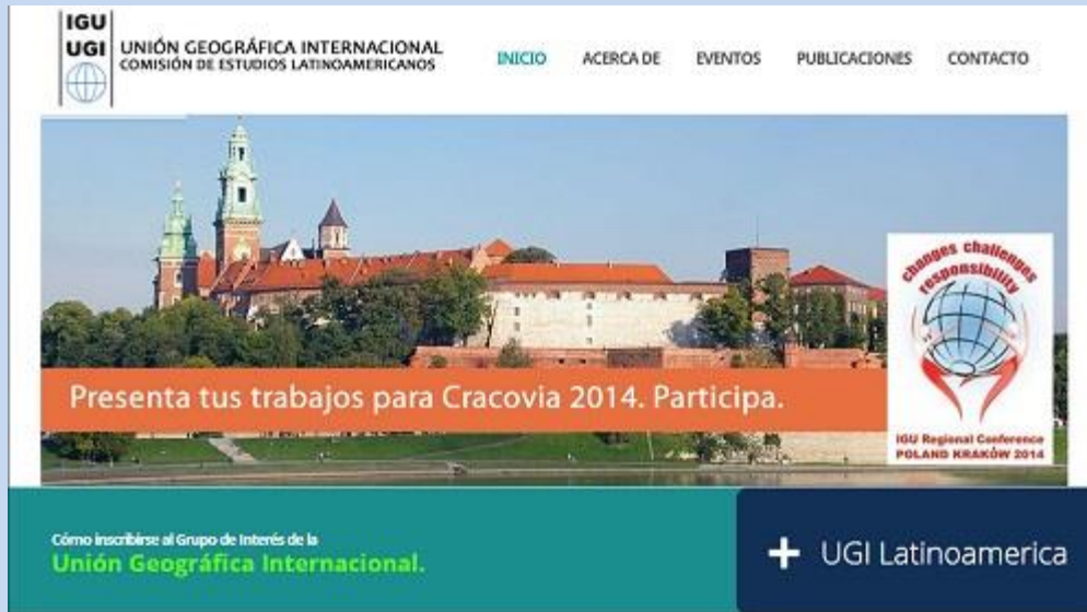
Página web de la Comisión de Estudios latinoamericanos de la UGI.

We have created two Facebook accounts one personal and the other as a fan page, we are also subscribed to twitter and have already created a YouTube channel.