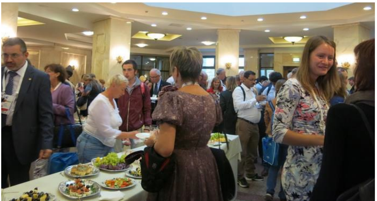
IGU 2015, Ice Breaking party IGU 2015 - Teleconference with the International Space Station