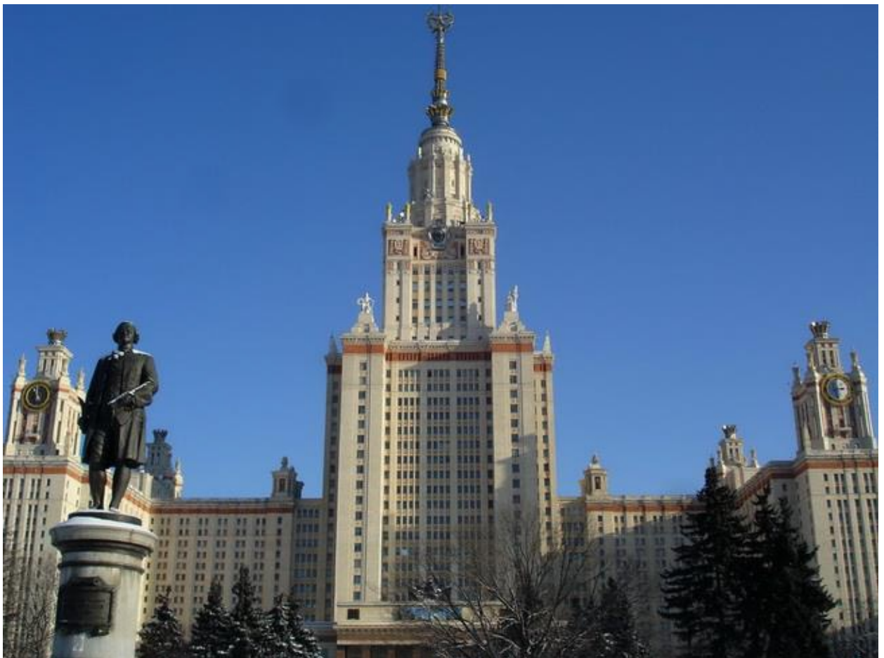
The venue of IGU 2015 Regional Conference, Lomonosov Moscow State University

The conference in Moscow was without doubt the major event in the life of the international geographical community in 2015. It was widely covered by Russian TV and other media and certainly contributed to the greater visibility of geography and a better understanding of its role in contemporary science and society.