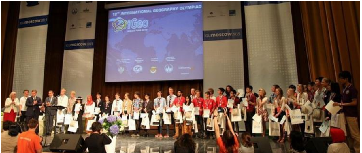
IGU 2015, awarding the Olympiad of Geography winners