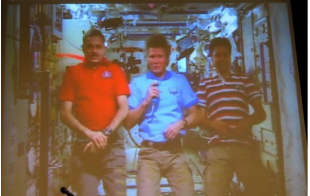
IGU 2015. Teleconference with the International Space Station