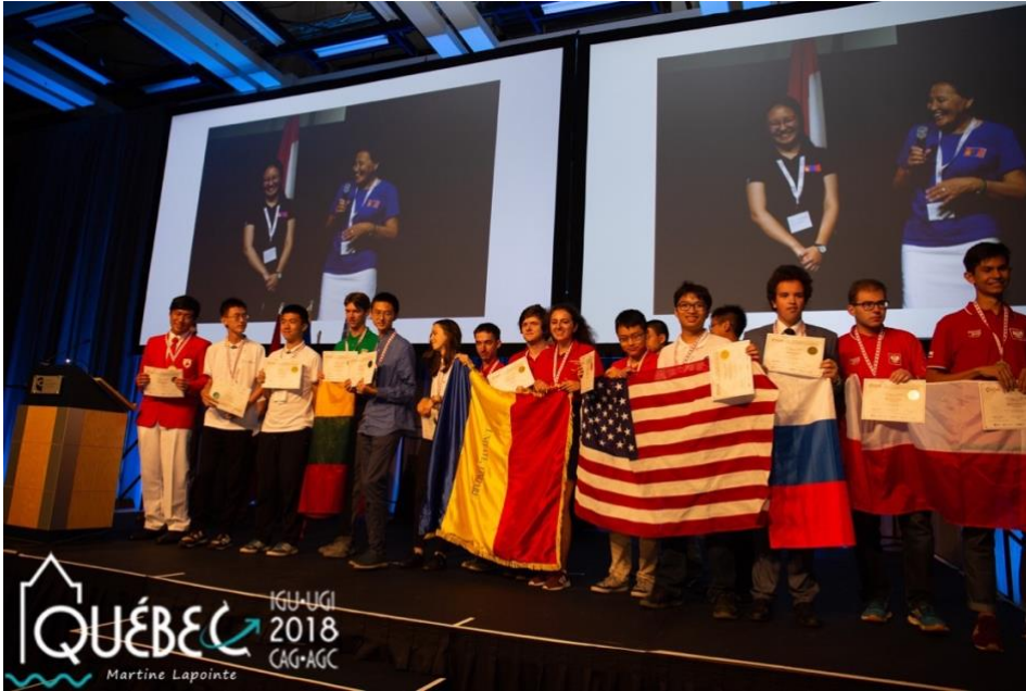
2018 iGeo Gold Medal Ceremony at the Quebec City Convention Centre August 6 th , 2018.