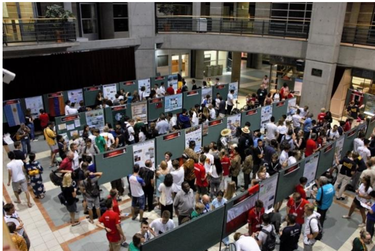
iGeo Poster Session, Université Laval campus

Argentina Armenia Australia Belarus Belgium Bosnia and Hercegovina Brazil Bulgaria Canada China-Beijing China-Hong Kong China-Macau China-Taipei Croatia Cyprus Czech Republic Denmark Estonia Finland Germany Hungary Indonesia Japan Kazakhstan Latvia Lithuania Mongolia The Netherlands New Zealand Nigeria Philippines Poland Romania Russia Serbia Singapore Slovakia Slovenia Switzerland Thailand Turkey United Kingdom USA