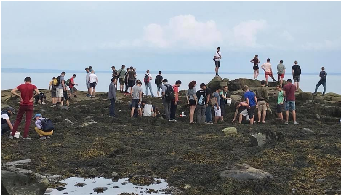
Post-excursion participants admiring the intertidal flora and fauna of the St. Lawrence Estuary.