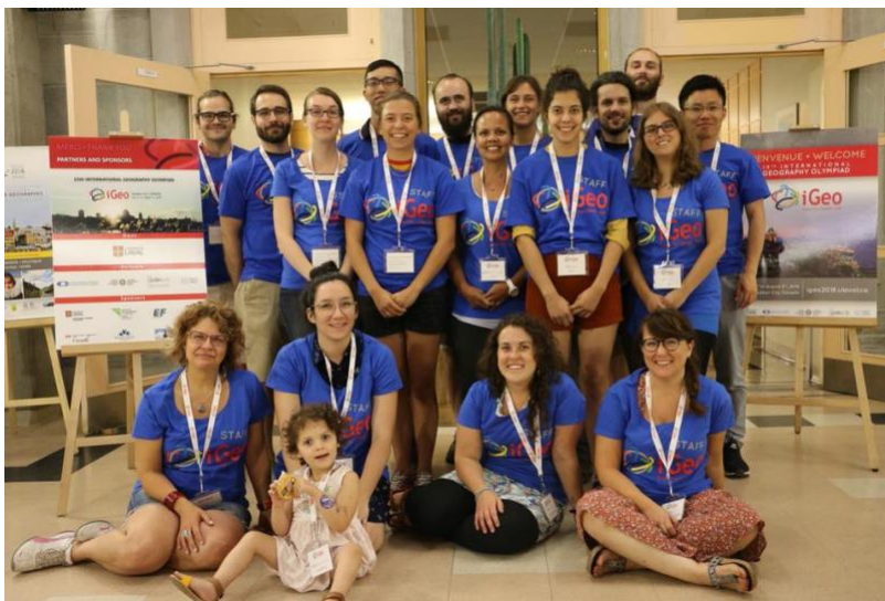
A few of the many invaluable 2018 iGeo volunteers from Quebec and across Canada.

The final full day of the iGeo, organized by Hugues Sansregret (Université Laval), was spent at the Forêt Montmorency – the world's largest teaching and research forest. Students learned about the boreal forest and the sustainable management of flora, fauna and soils for environmental, social and economic purposes. Lunch and supper, featuring local forest products, were served by the Forêt Montmorency. The evening was crowned by a wildlife concert performed under the stars in the heart of the boreal forest by musicians seated in boats in the midst of a Northern lake – the music mimicking the sounds of wolves, moose and loons. It was an intimate experience with Quebec's nature and culture that etched itself in the memory of all who attended!