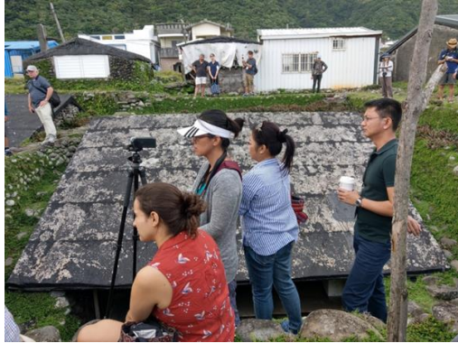
In the field.