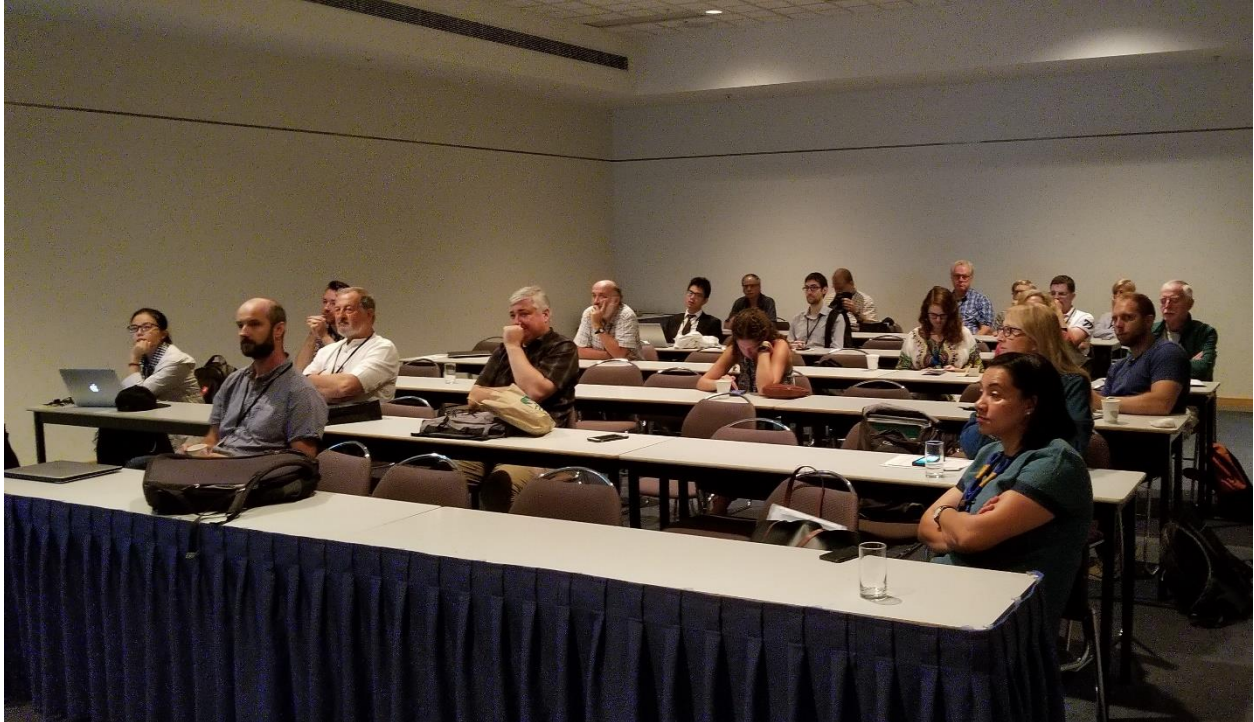
Commission members and participants at the Quebec City meetings

The Applied Geography Commission participated at the 2018 IGU Regional Conference - CAG Annual Meeting - NCGE Annual Conference held in Quebec City on August 6-10, 2018. The Commission hosted three sessions featuring 12 papers in the broad subjects of Market Geographies; Transportation, Tourism, and Community Spaces; and Cities and Planning.