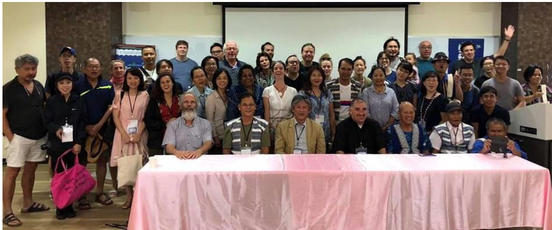
Conference participants at one of the five conference venues, Lanyu High School.

The conference provided an opportunity for the Commission to hold a Steering Committee meeting on the first evening after the reception in Taipei (transfer to the island the following morning), with seven members present. The committee discussed the lull in activity during the transition to a new steering committee, and resolved to intensify activities by establishing a biannual newsletter, re-introducing a Commission website, as well as a Facebook site in order to facilitate the sharing of information on research projects, publications, workshops, societal engagements, etc. These would complement actively circulating more information regularly on the commission mail list. We furthermore discussed organizing meetings in 2019 and 2020 (see below).