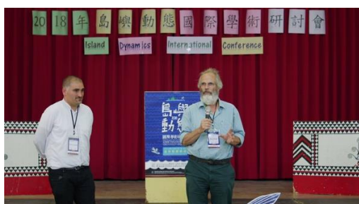
Opening Ceremony at Lan-En Kindergarten.