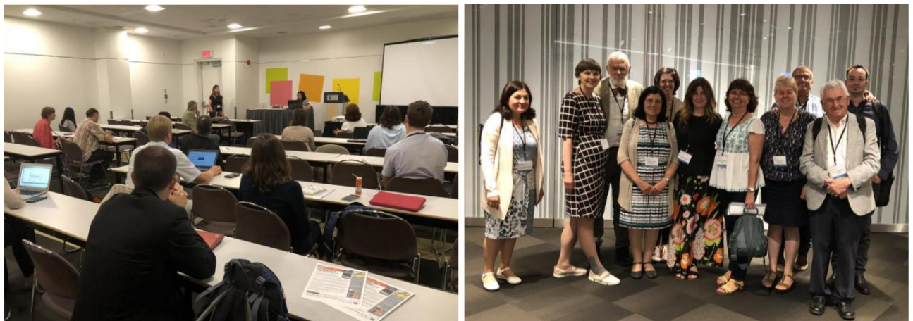
Groups of attendants to the Globility sessions in the Québec Meeting