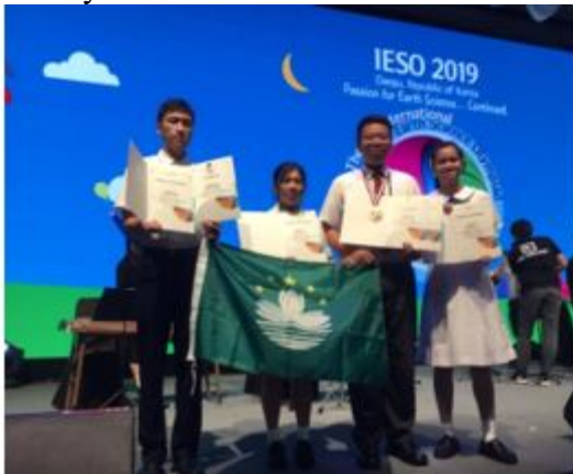
International Earth Science Olympiad 2019

This is the second year that we participated in the International Earth Science Olympiad (IESO). The IESO was organized in Korea this year in late August. This year, one of the team members from CHINA-MACAU won a Bronze medal and two of the members received Gold medals in their poster presentation respectively. This is undoubtedly a successful step and we will try our best in the future.