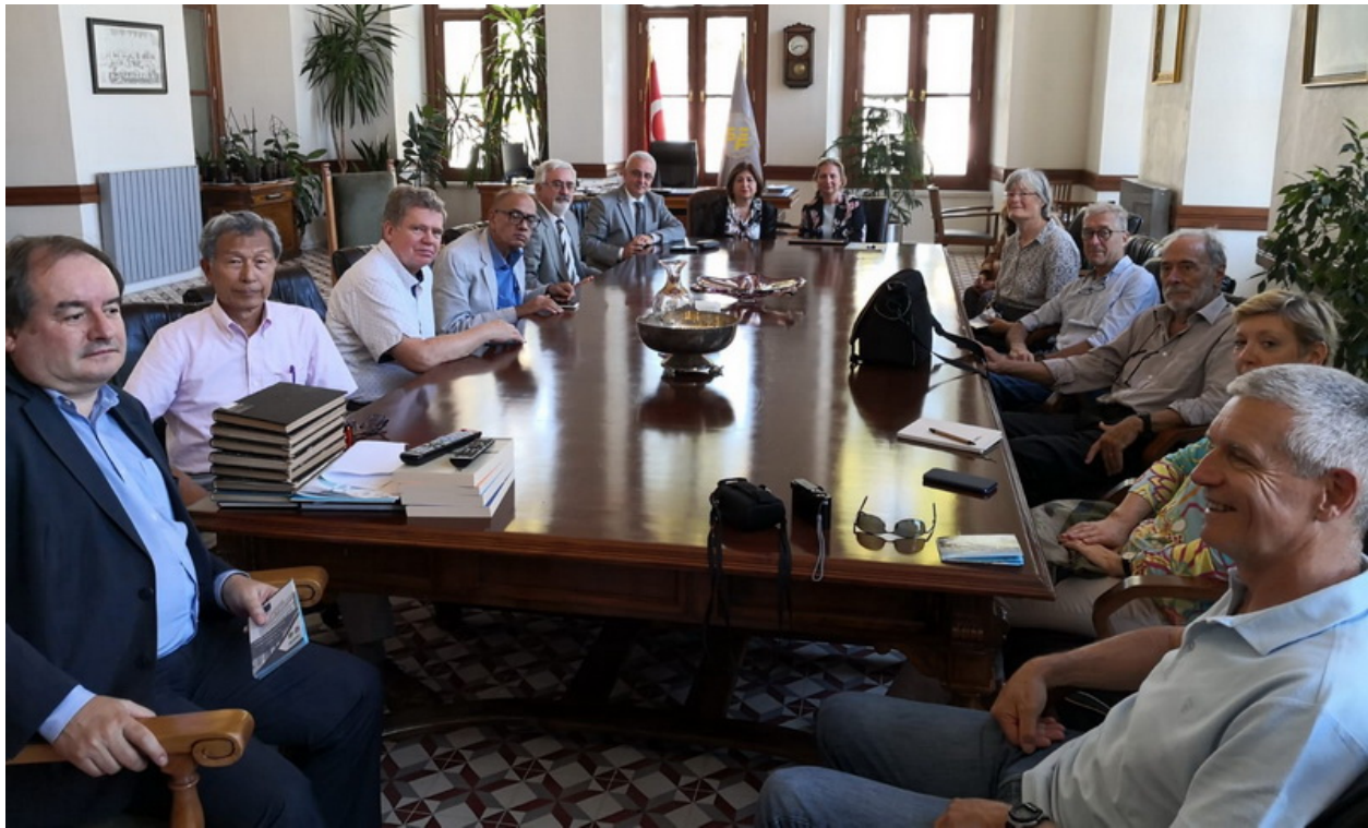
Visit in the Istanbul University