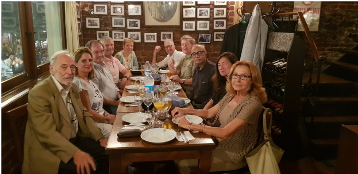
Dinner in the Hazzo Pulo Restaurant