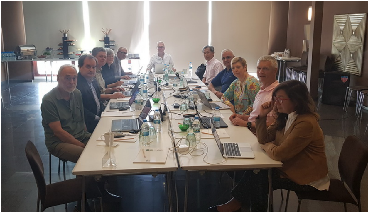
During a Session