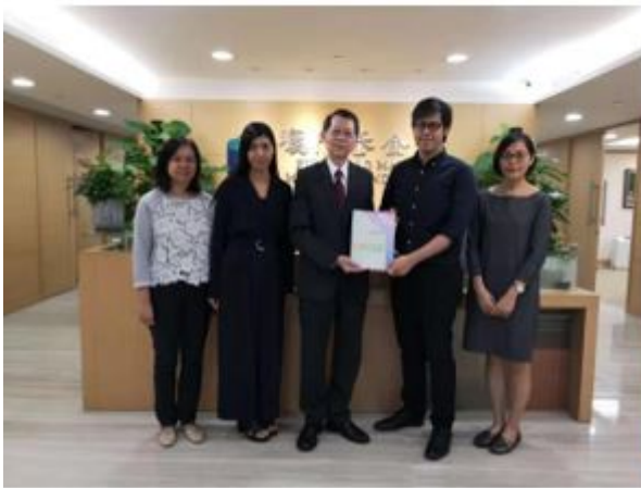
Left: Official visit to Fund for Science and Technology Development, Macau S.A.R