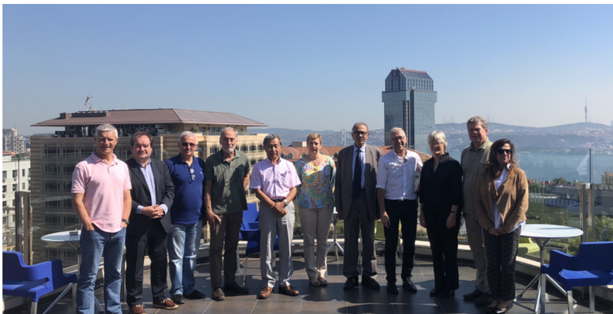
Relaxing on the Hotel terrace