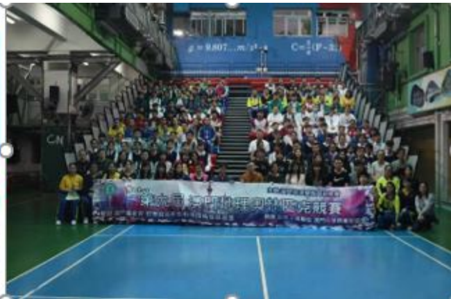
Macau Geography Olympiad