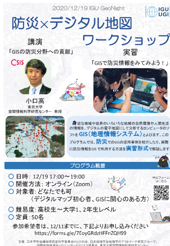
Poster of the GeoNight event